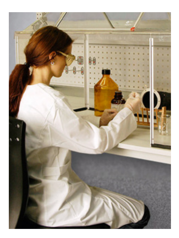
Space-saving mobile ACD type units can be utilised at laboratory work places.

Low noise level and low energy consumption. Simple operation and maintenance. Recirculation operation possible. Easy and contamination low filter exchange.