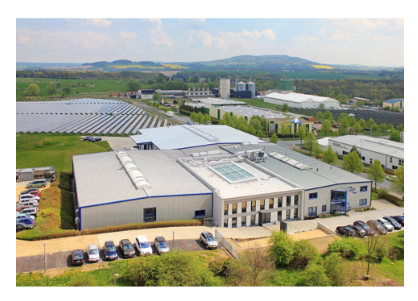
Based on sophisticated series devices ULT AG provides adapted solutions for extraction and filtration technology.