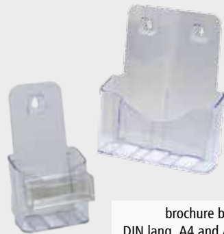
brochure box DIN lang, A4 and A5