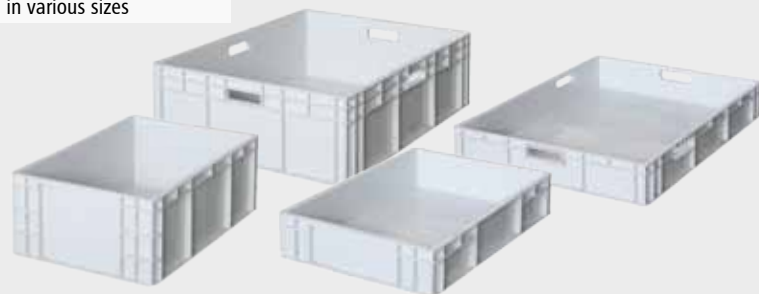
euro-containers, available in various sizes