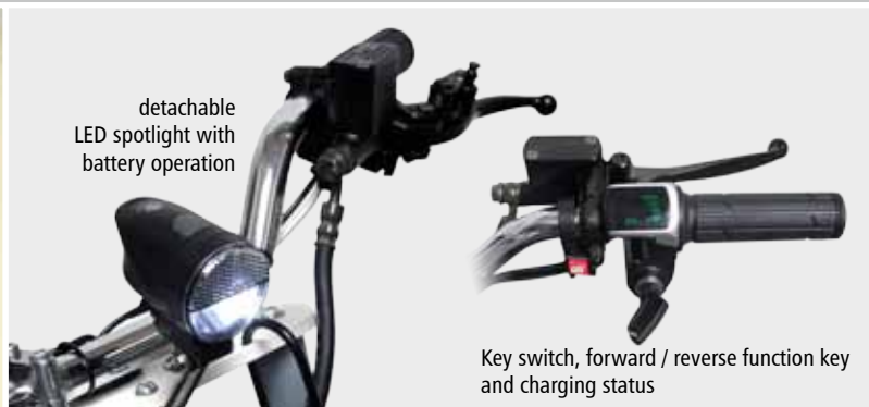
detachable LED spotlight with battery operation